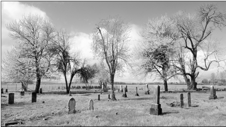
Luper Pioneer Cemetery will be open for tours and viewing on Memorial Day weekend