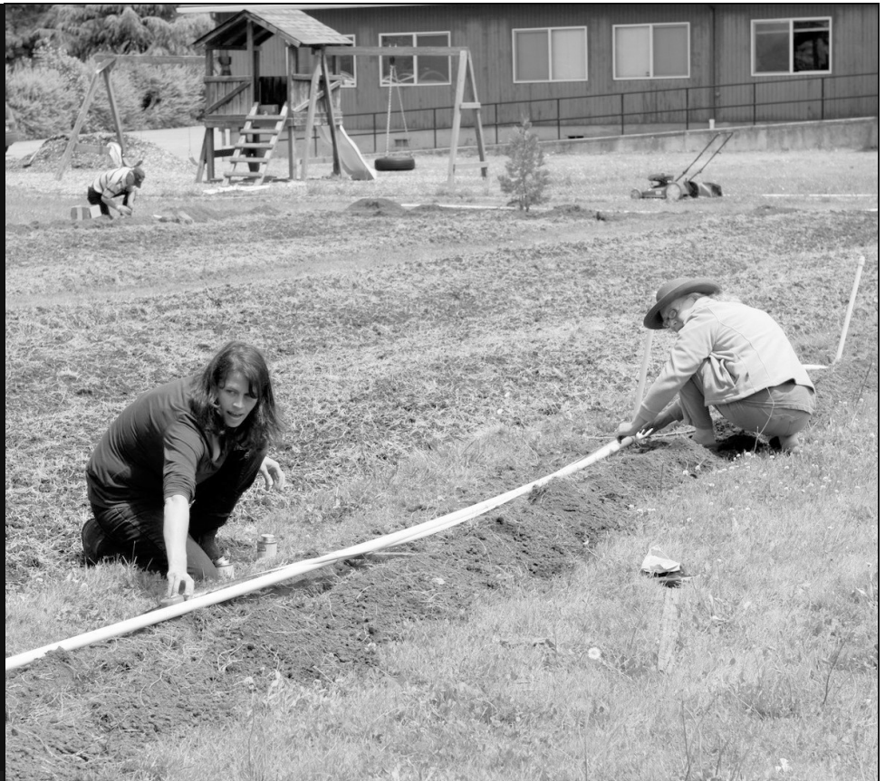
The Santa Clara Community Garden was first tilled in 2012 at St. Matthew's Episcopal Church

-proof of local address -bring bags for carrying groceries.